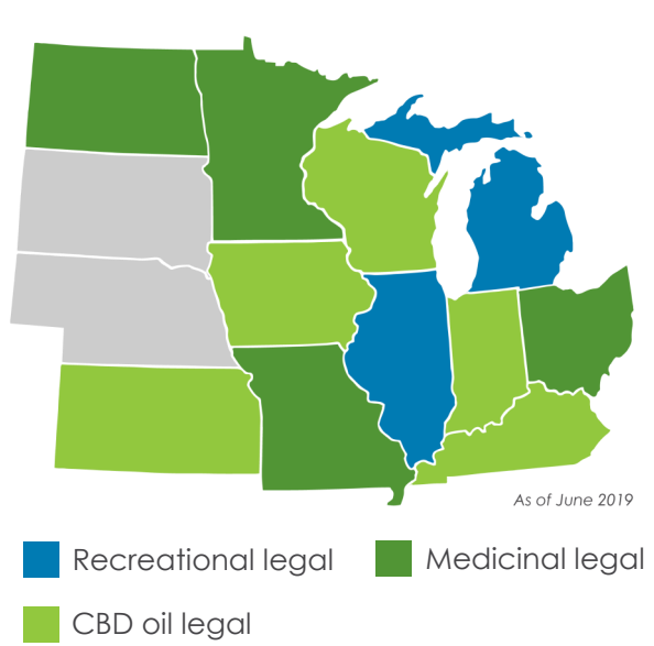
Legal Status of Cannabis in Midwest States

This uncertain legal outlook, coupled with the high energy demands of new grow operations can make it difficult for utilities to plan their future generation needs.