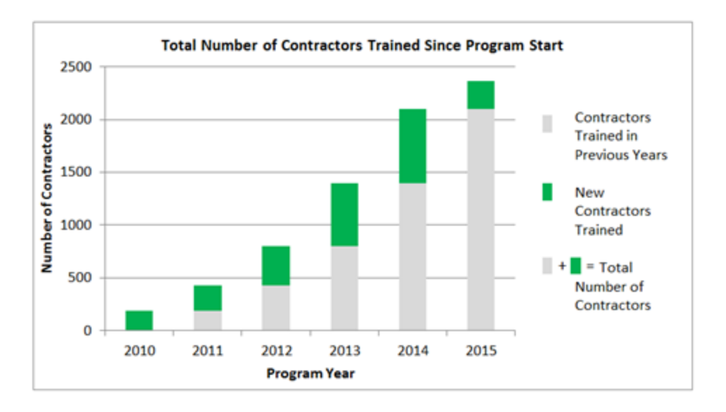
Figure 2. Growth of trained contractors

The number of installations that have been completed as a result of the HVAC SAVE program has grown substantially through the years as well, as seen in Figure 3. In 2012, there were 1,156 VQIs submitted in the software, whereas in 2014, the first year HVAC SAVE was required for customer rebates, there were 24,000 HVAC SAVE VQIs completed. There were 39,112 VQIs completed for calendar year 2015. The installations completed in 2014 have an average HVAC SAVE equipment score of 95.8 and have an average HVAC SAVE system score of 76.8. The average equipment score of 95.8 is over 25 points higher than the baseline equipment average of 70.