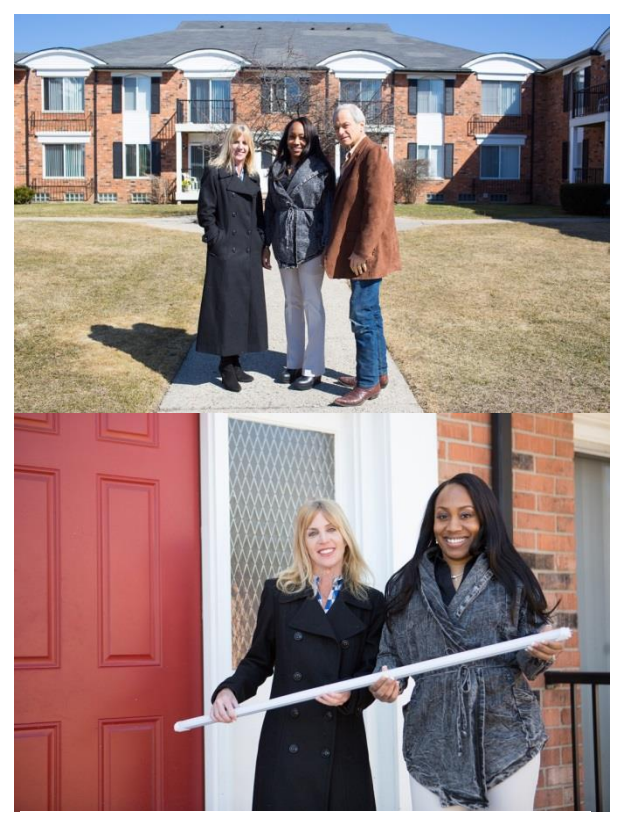
The French Quarter Apartments in Detroit, Michigan benefitted from energy efficiency improvements financed by the Michigan Saves program.

What Makes it Notable? Michigan Saves helps lower operating costs and improve cash flow for multifamily building owners. The energy