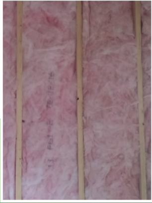
No noticeable gaps or compression