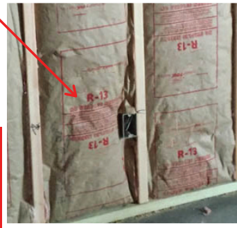
Insulation is not cut around electrical box