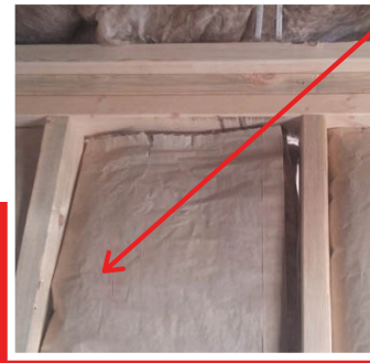
Significant gaps and insulation does not fill entire cavity