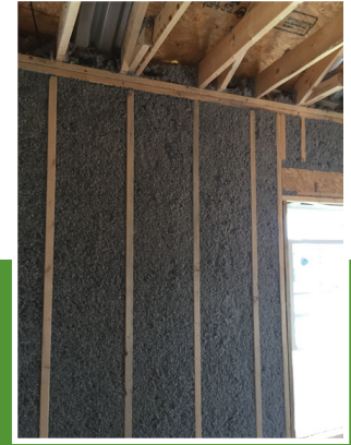
Insulation in full contact with all six sides of stud cavity