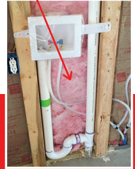
Insulation is not cut and split around plumbing

Note: Installing water lines in exterior walls is not recommended.