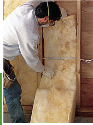
Insulation is cut and split around electrical wiring