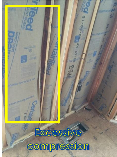
Grade II: Not Compliant