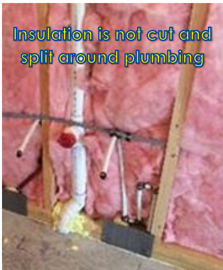
Grade III: Not Compliant