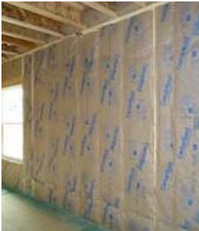
Grade I: Compliant