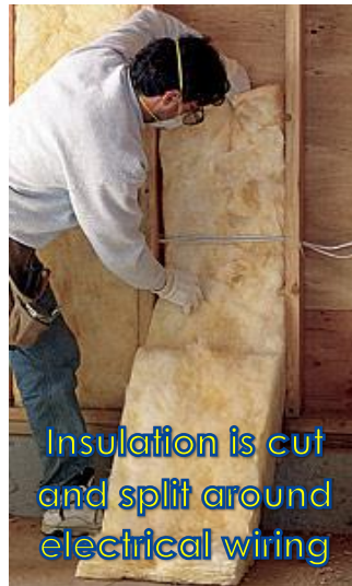
Grade I: Compliant