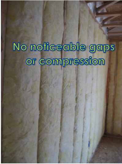
Grade I: Compliant