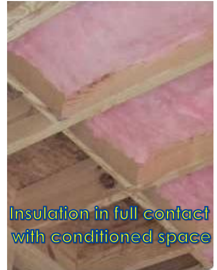
Grade I: Compliant