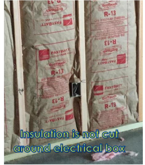
Grade II: Not Compliant