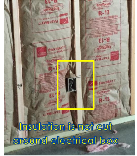
Grade II: Not Compliant