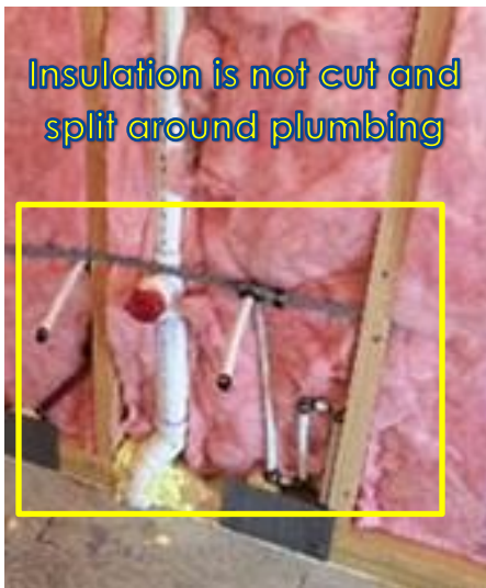
Grade III: Not Compliant